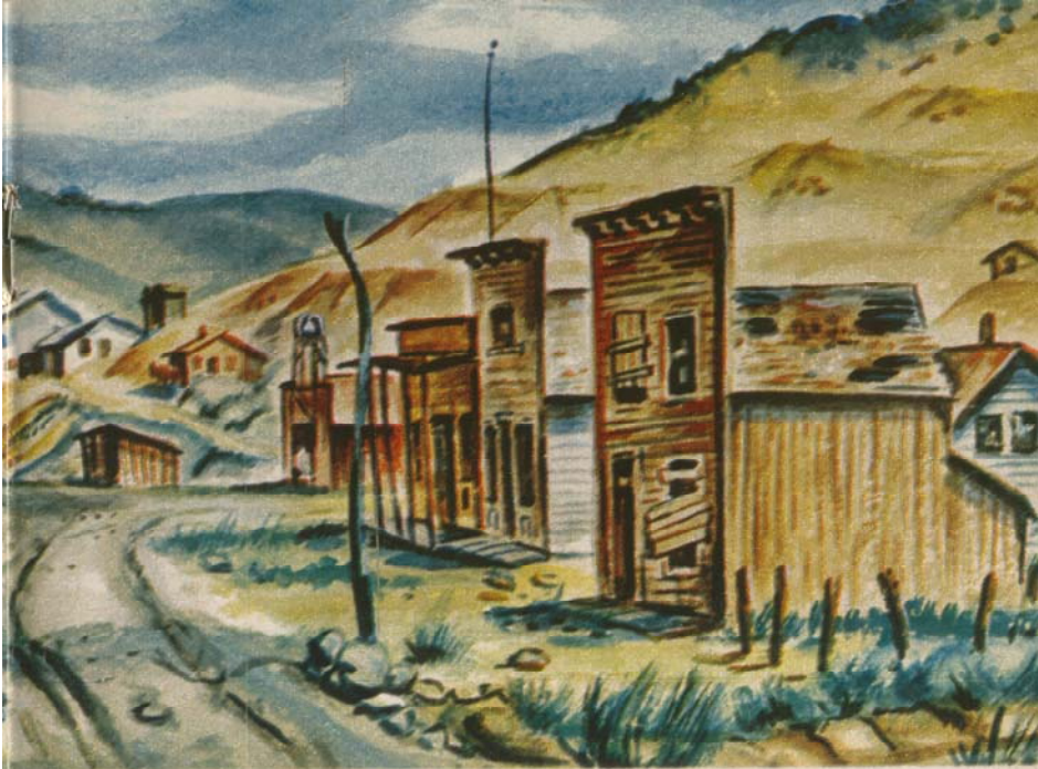
ult (red building, at rear, left), fire house (rear, right)