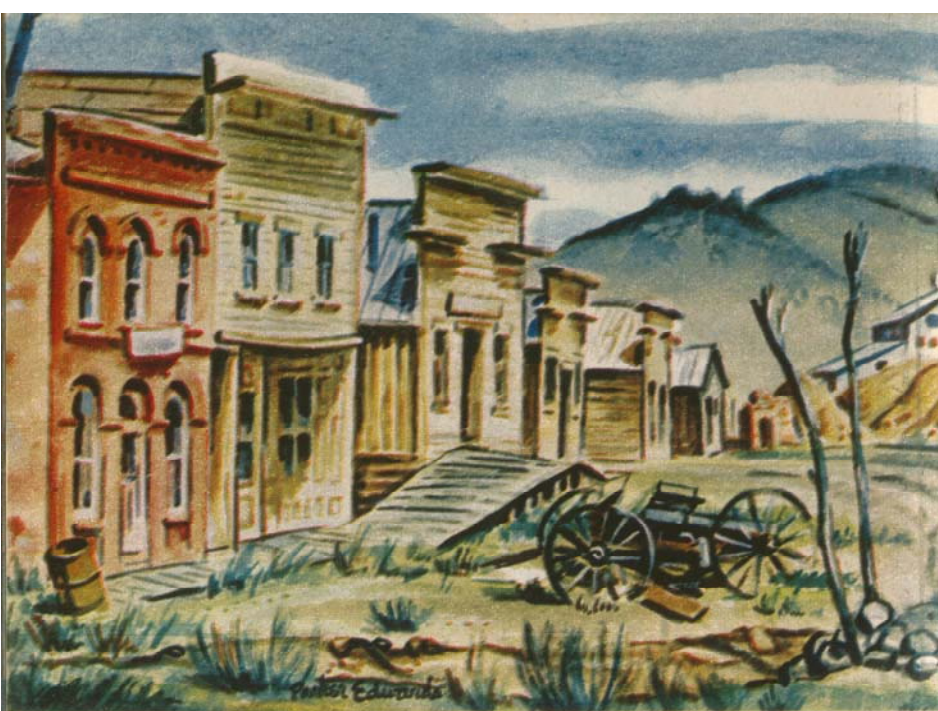
The main drag in Bodie, California, with the bank ve