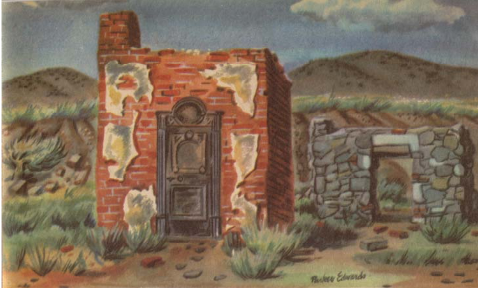
Above: vault of the Bank of Bodie; below: the Bodie fire house. Parker Edwards' pictures accompany the story on Bodie, page 32.